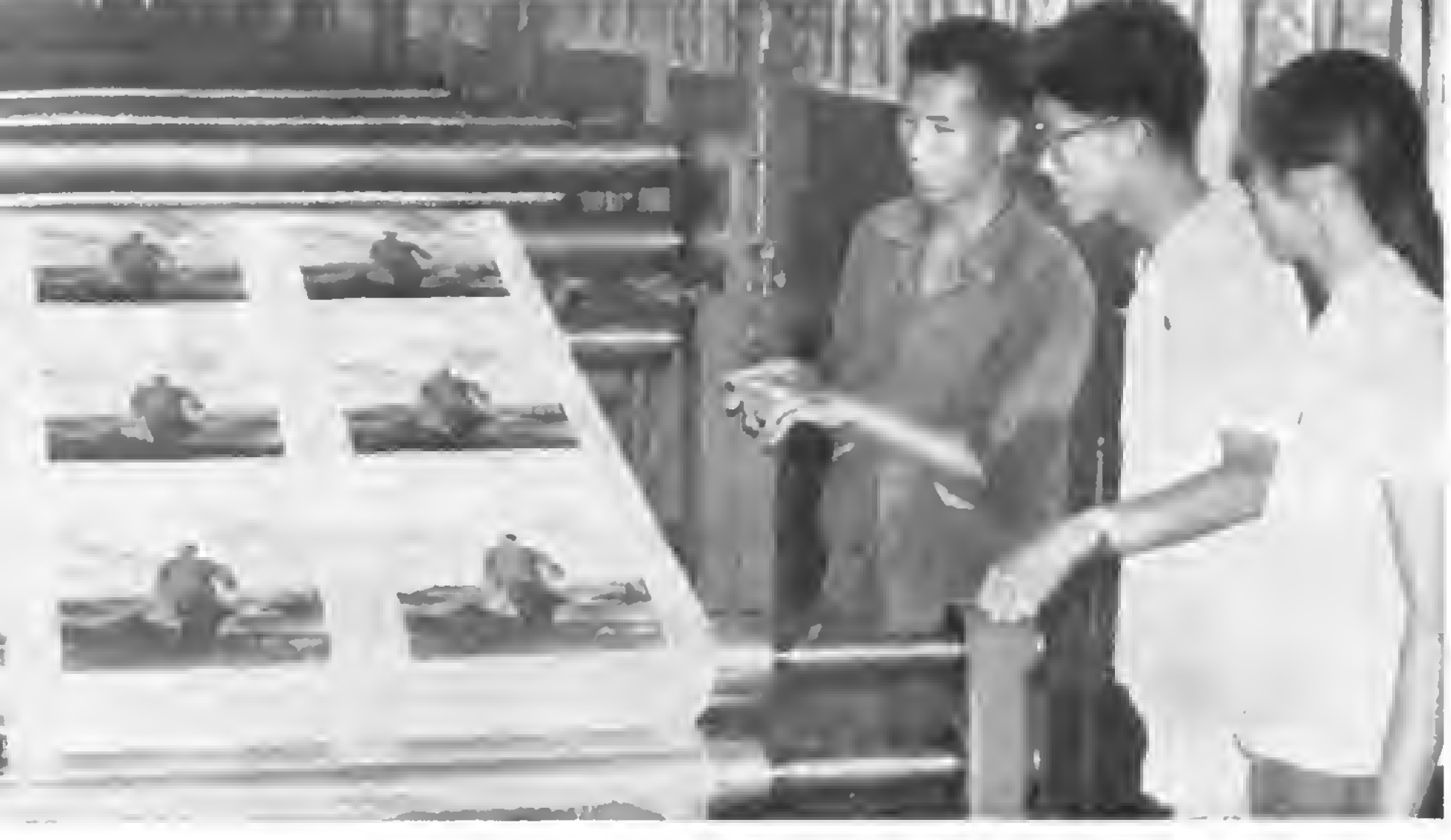
The author (centre) with workers who helped make reproductions of the revolutionary oil painling "Chairman Mao Goes to Anynan".

and make more and better pictures of Chairman Mao.